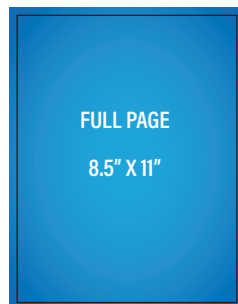
Live area: 8.5" x 11" Bleed 0.25"